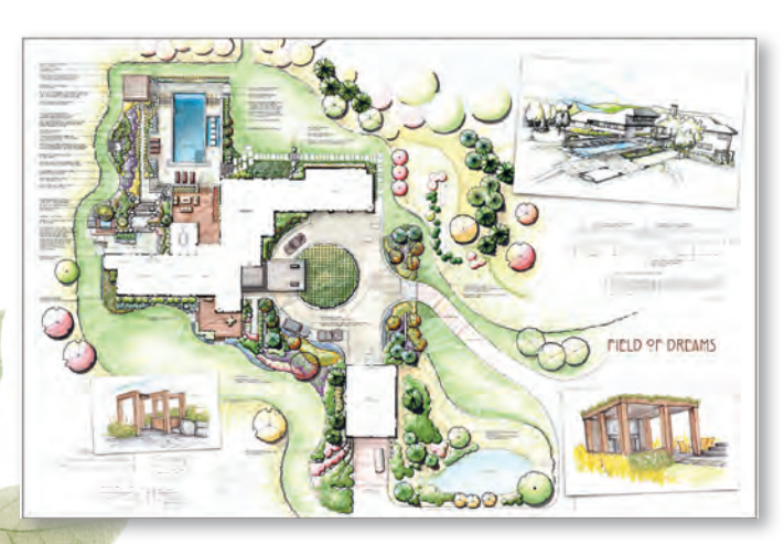
Private Residential Design 5000 sq ft or more THE LANDMARK GROUP

Residential Construction Under $10,000, $10,000 - $25,000, $25,000 - $50,000