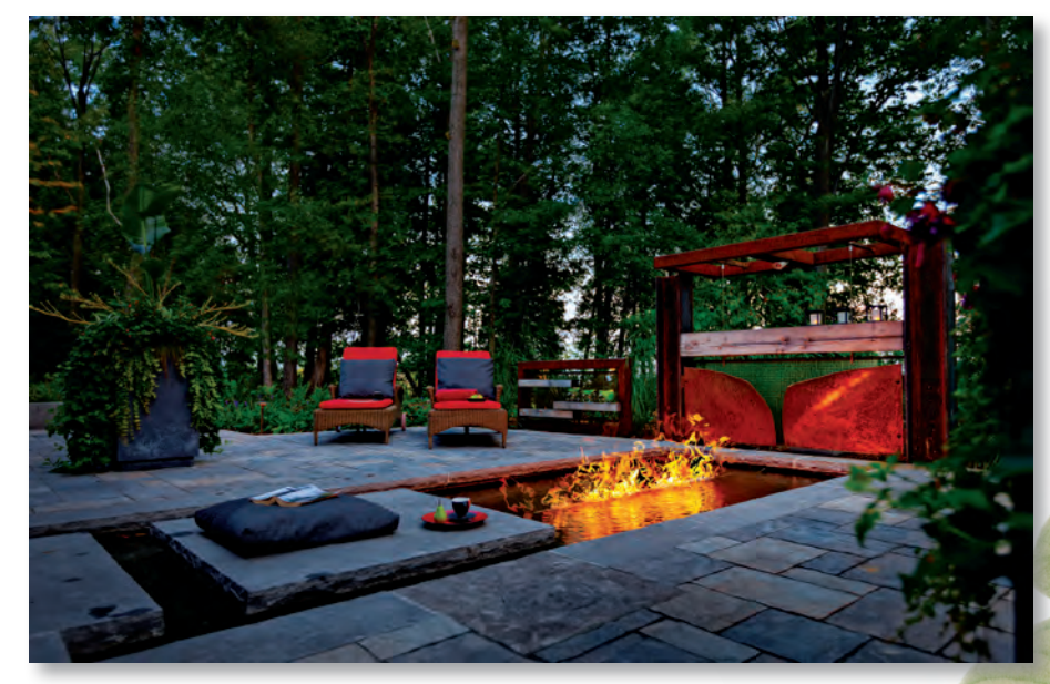
2013 Winner of the Casey van Maris Award THE LANDMARK GROUP

Residential Construction $50,000 - $100,000