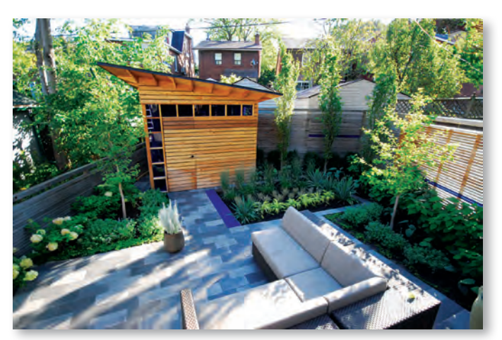
Residential Construction $25,000 to 50,000 SHIBUI LANDSCAPING