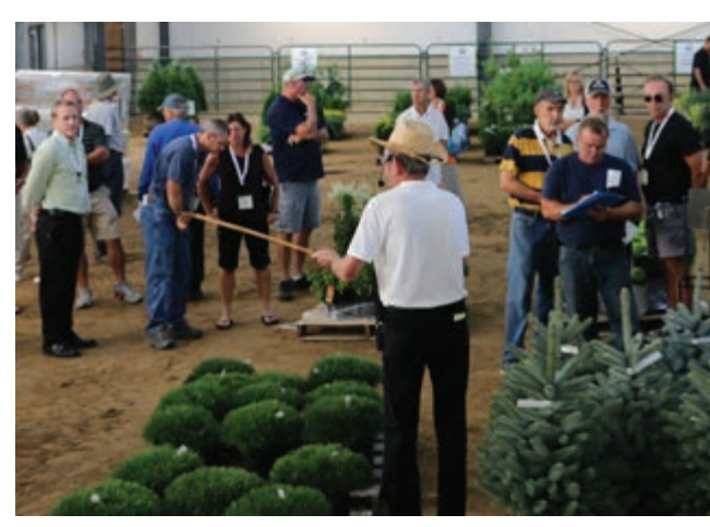
The industry auction is organized by LO's Growers Group.

The Landscape Lighting Conference has been growing in attendance for the